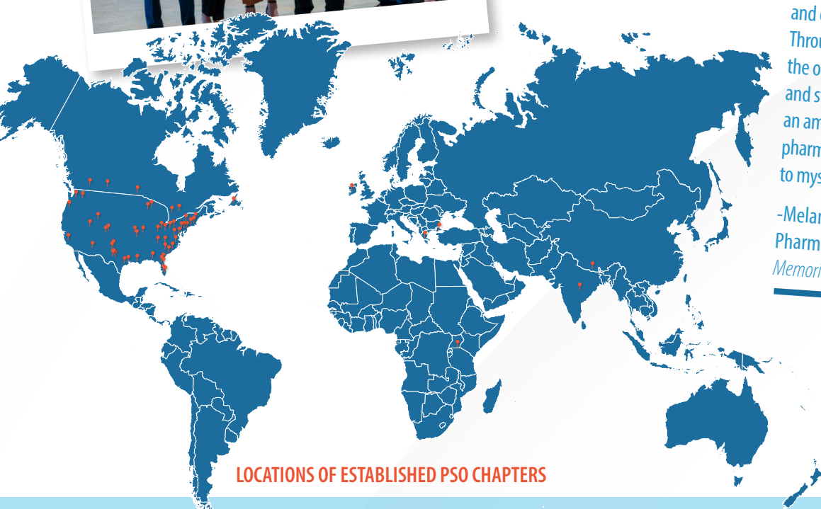
LOCATIONS OF ESTABLISHED PSO CHAPTERS

FOR MORE INFORMATION OR TO SUGGEST NEW CHAPTERS: