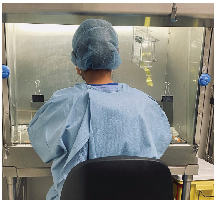
A pharmacy technician at Georgia Cancer Specialists compounds medications for a patient.

patients have a blood glucose greater than 250 mg/dl.” This recommendation is also included in Table 2 in the PQI. 5