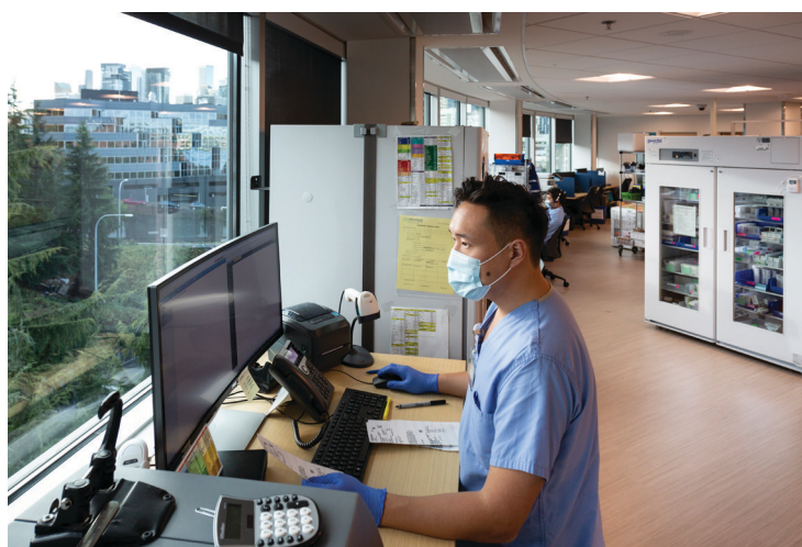
A pharmacist reviewing an order at Seattle Cancer Care Alliance.

Empowered with innovative tools like the PQI, the Medically Integrated Teams have improved the quality of care delivered at their institutions through adoption of NCODA resources. These leading oncology organizations value the PQI which provides concise, clinical guidance information to raise the standard of care across all the professional disciplines. In general, PQIs afford attention to any critical aspect of drug therapy that may be easily overlooked (“if you see ‘x’, remember