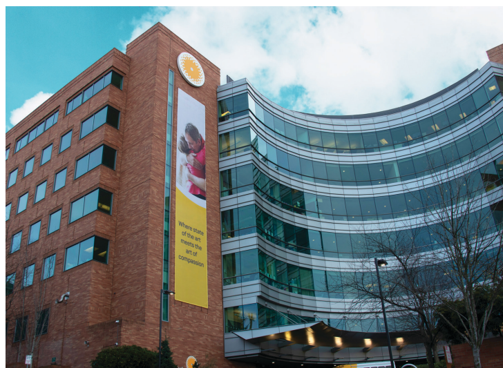
Seattle Cancer Care Alliance located in Seattle, WA.

The PQI Background goes on to discuss adverse effects seen in the trials. The subsequent sections of the the PQI delve into these adverse effects and various management strategies-